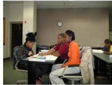
Students on their first day of class

demics are cornerstones of the new CMA. Classes will run from 12:00 pm until 4:00 pm on Friday after-