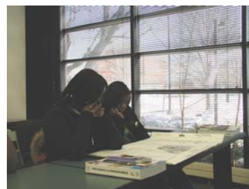
Students reviewing blueprints

noons, beginning on February 6 and ending on May 29. Costs associated with the CMA will be underwritten by the CMSD. Tri-C's United Technologies Center (UTC) will be the location for classes.