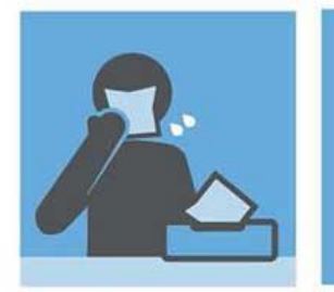
COVER YOUR MOUTH WITH A TISSUE OR SLEEVE WHEN COUGHING OR SNEEZING