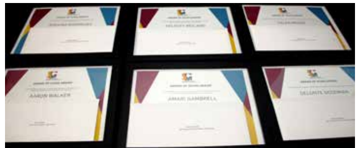
Top: Students from New Tech advance to dais to receive their award. Bottom: Scholarship awards and checks for ACE students on display at banquet.